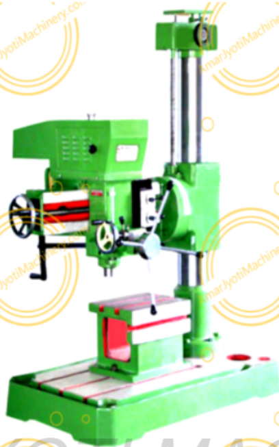
RADIAL MOTOR LIFT