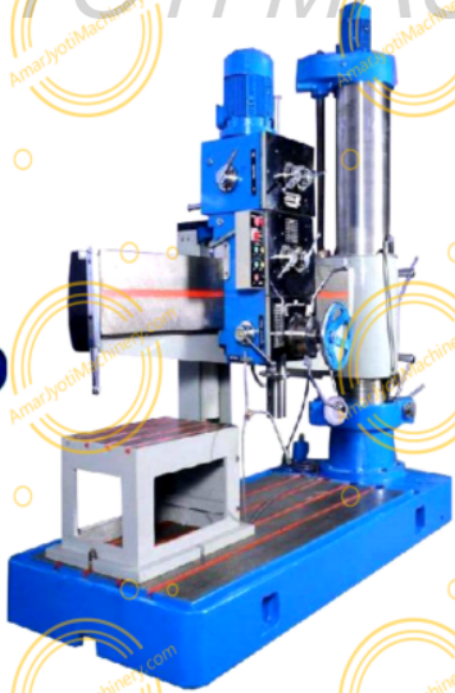
RADIAL ALL GEARED HEAVY