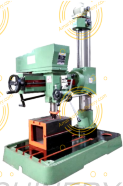
RADIAL MOTOR LIFT HEAVY