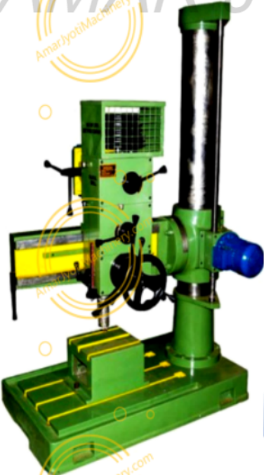
RADIAL AUTO FEED AND AUTO LIFT